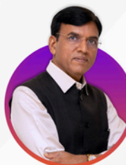
Dr. Mansukh Mandaviya Hon’ble Union Minister, Ministry of Youth Affairs

MY Bharat Budget Quest ने देश के युवाओं को Viksit Bharat Budget Vision से जोड़ने का कार्य किया है। इसने आपको केवल एक listener नहीं, बल्कि policy-making process का stakeholder बनाया है।